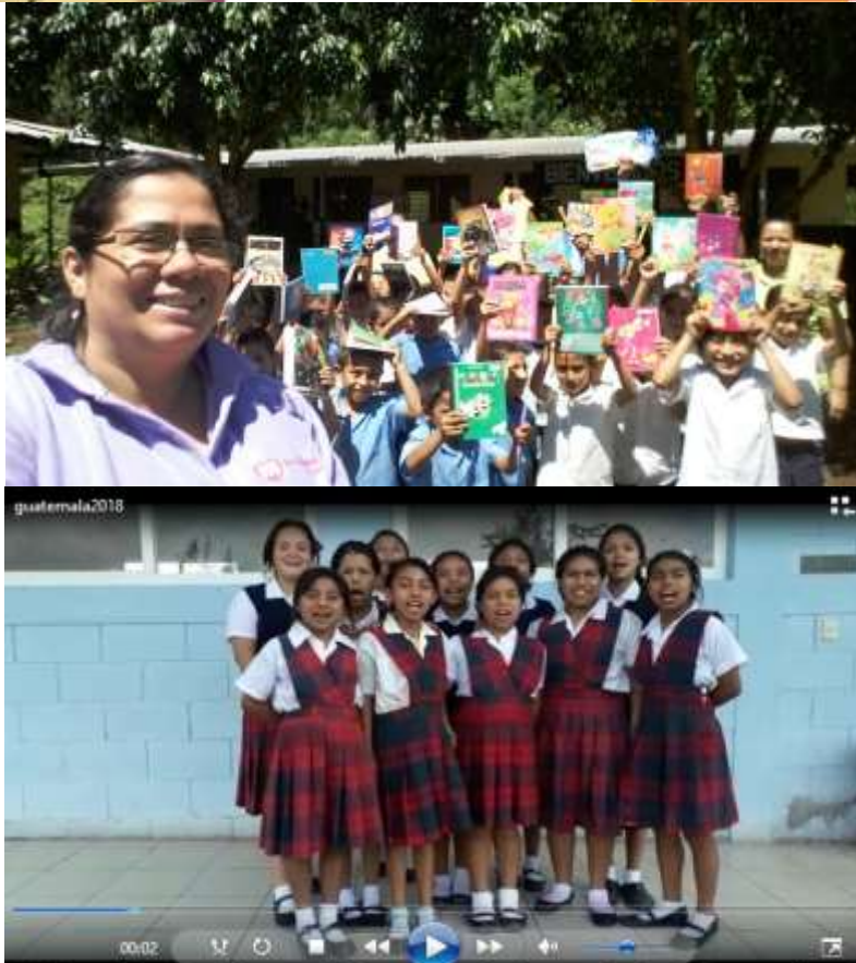
Video Casa - Hogar "Nuestra Señora de los Remedios"